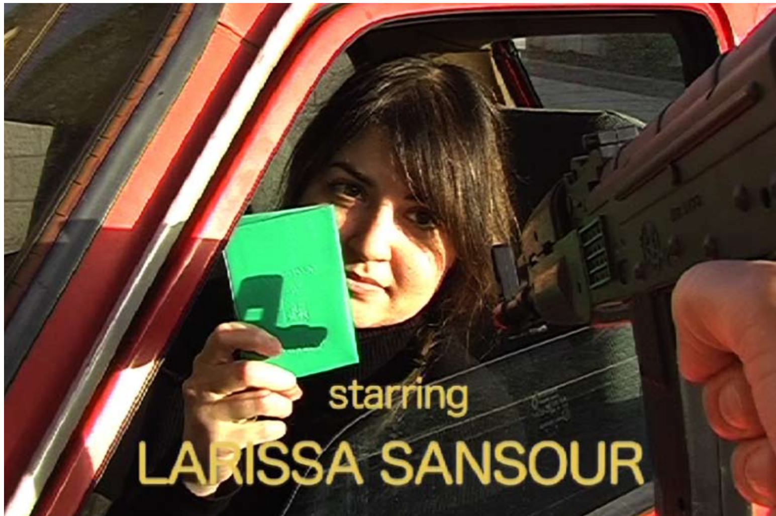
Larissa Sansour Stills from Happy Days , (2006) single-channel video