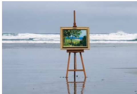
Top left: Sherry Wiggins “ Sound of the Ocean ,” Lemon Tree for Suhair , (2006) archival digital print

Upon returning to the U.S., Wiggins performed a meditative ceremony in which the essences of several dreams were symbolically recreated. By setting an empty frame on an easel near the ocean, the artist provided a metaphoric blank canvas onto which these dreams could be projected. Representational objects and images were then placed in the frame and photographed. Thus, “ Sound of the Ocean ” (2006) is a series in which the unrequited hopes of Palestinians living under the occupation are personified. For many Americans the desires expressed in Wiggins’ series are easily obtainable. Yet to hear the sounds of the ocean or to have the freedom to travel and study are desires that will most likely never materialize for those unable to leave many areas of Palestine. Upon examination of each photograph it becomes gradually more apparent that the artist’s ritual speaks of lives interrupted, as individual and collective aspirations are suspended.