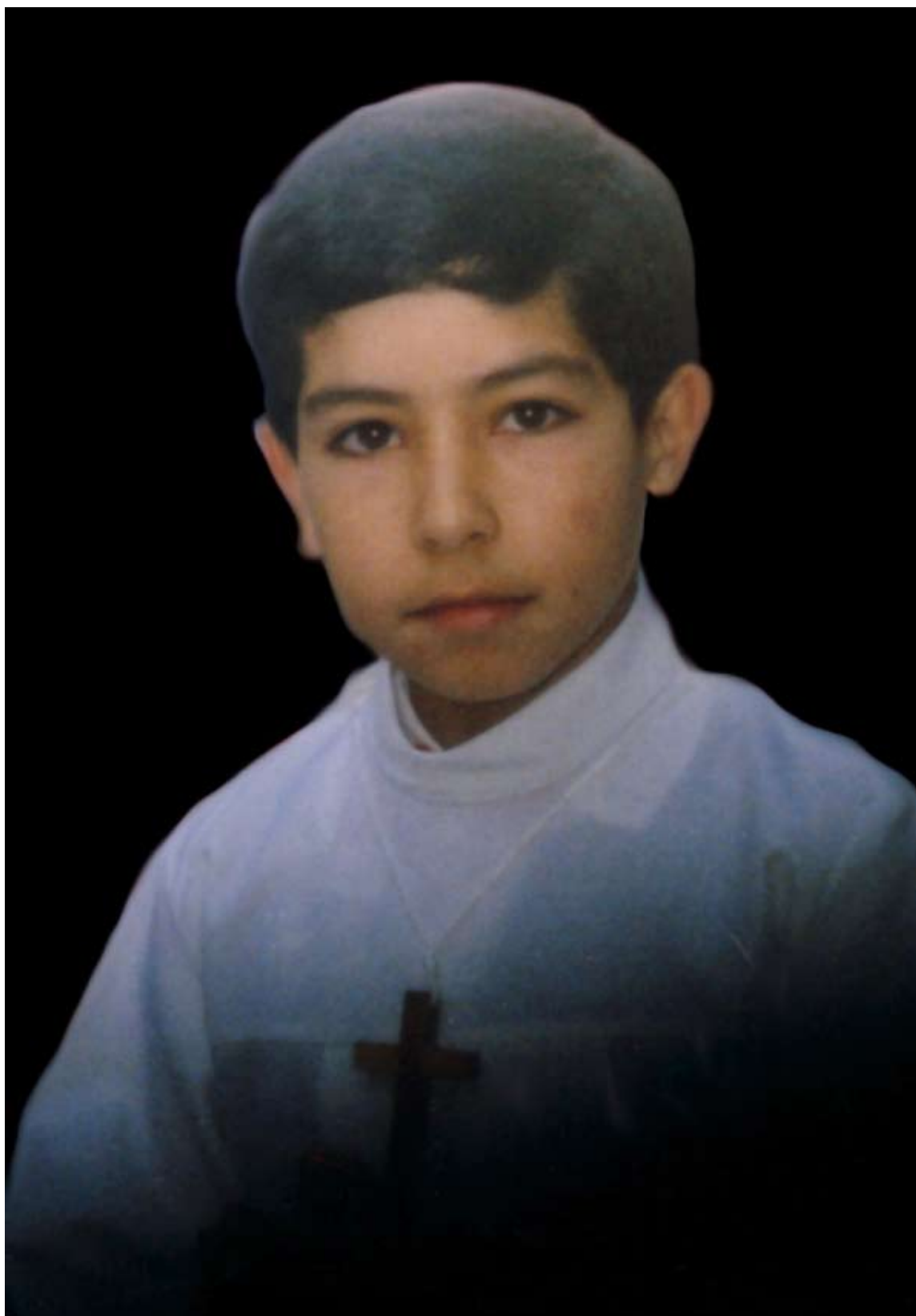
Faten Nastas Transfiguration (2006) still from mixed media installation