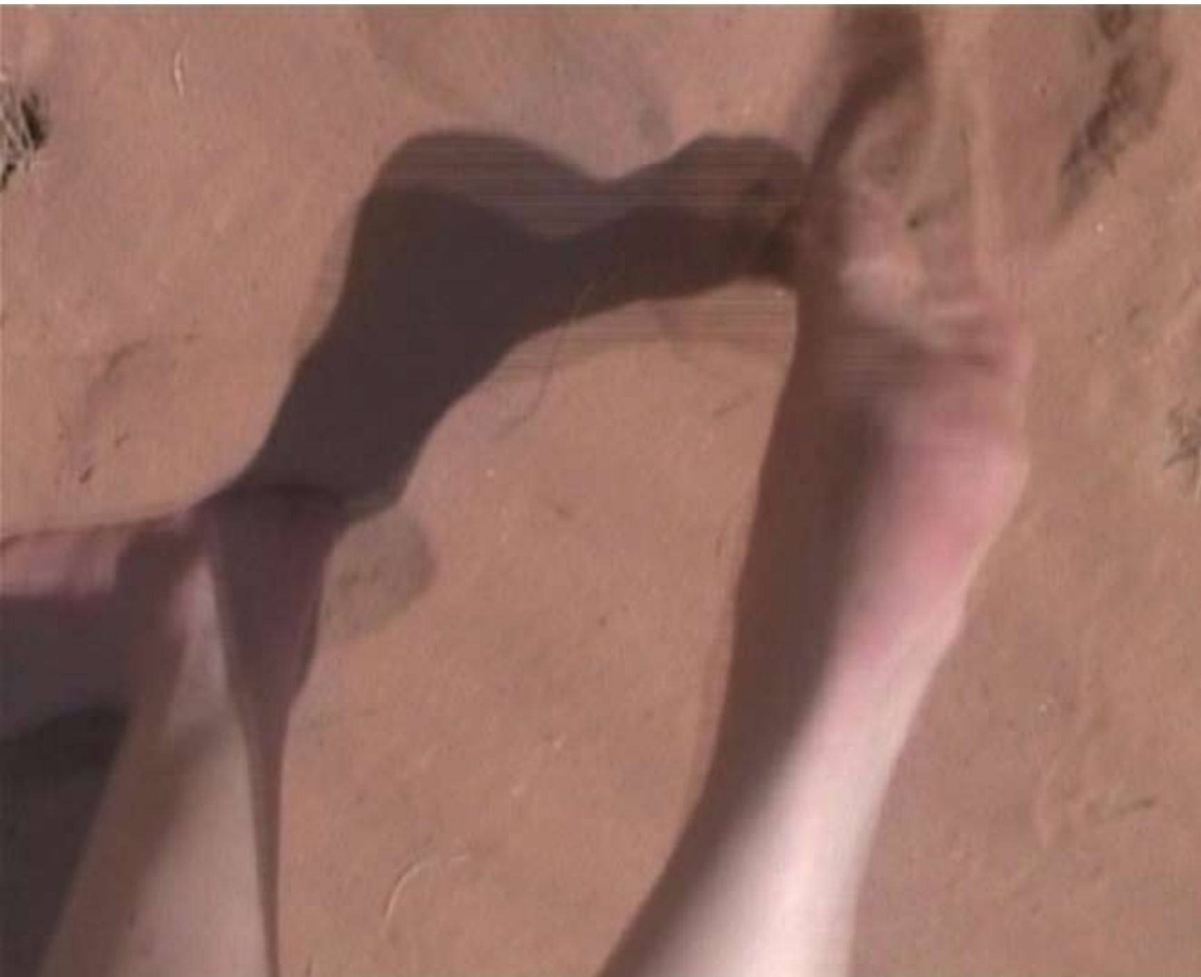
Reem Bader Stills from Turning 40 , (2006) single-channel video