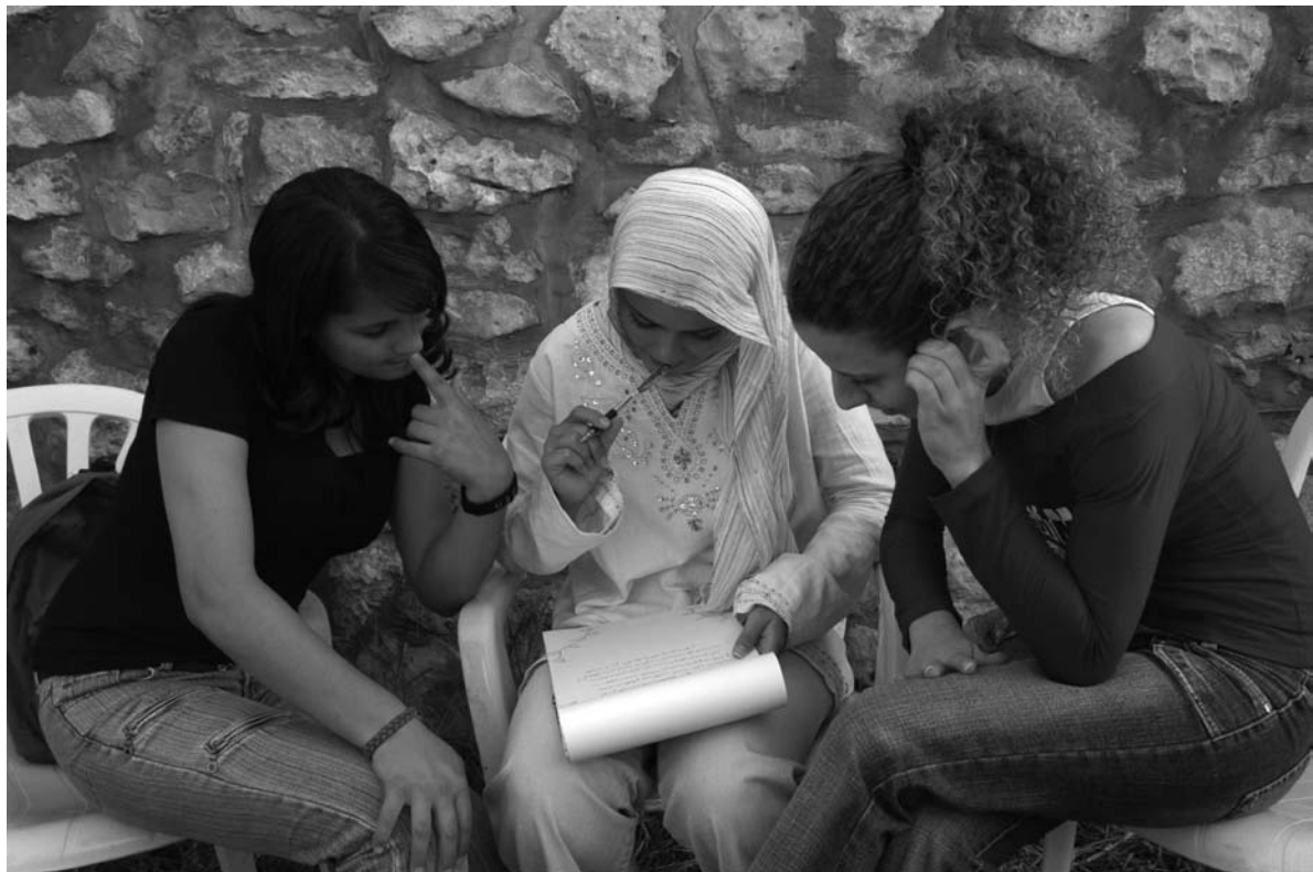
Young artists participating in a 6+ workshop, Dheisheh Refugee Camp, Palestine

No one is overly optimistic about the possibility, once described by Edward Said, of mutual peace and recognition between Israel and Palestine, of acknowledgement of the other as equal—a vision of "coexistence and sharing in ways that require an innovative daring and theoretical willingness to get beyond the arid stalemate of assertion, exclusivism, and rejection." 10 But the fact of this collective project, created by women artists defying national foreign policies and calling on the basic feminist values of "generosity, empathy, and reciprocity," is ultimately hopeful. Secrets , even when kept, grow in significance as clues to their meanings accumulate, gradually surfacing into common knowledge.