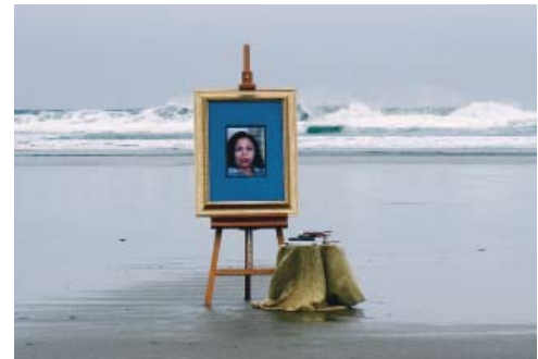
Top Right: “ Sound of the Ocean ,” Freedom for Taghrid , (2006) archival digital print