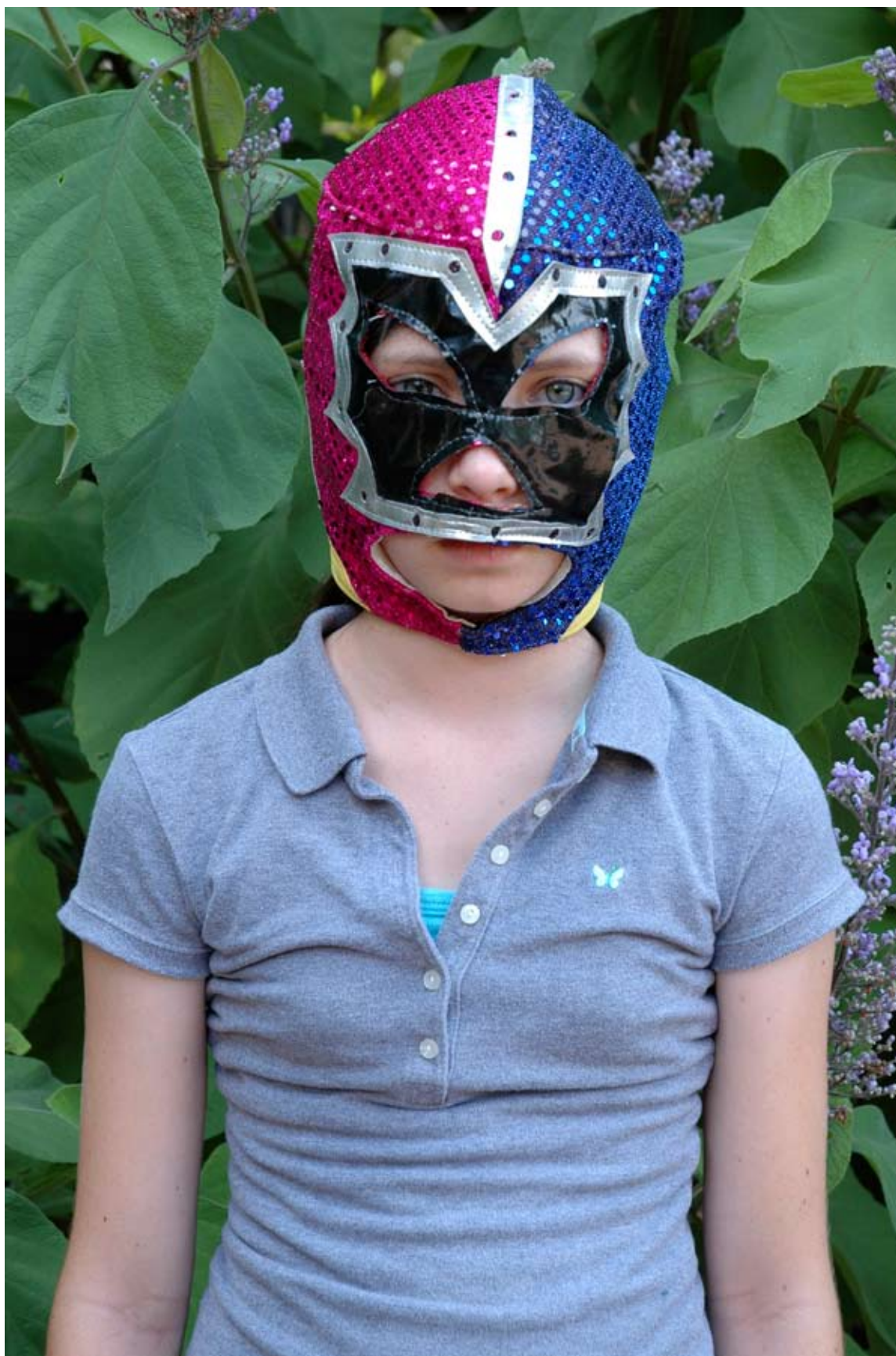
Wendy Babcox Secret Agendas , (2006) archival digital print