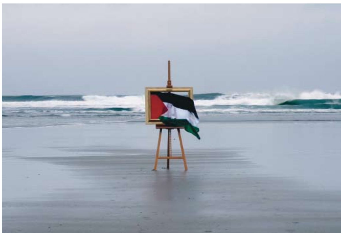
Top: Sherry Wiggins "Sound of the Ocean," Dreams for Palestine , (2006) archival digital print