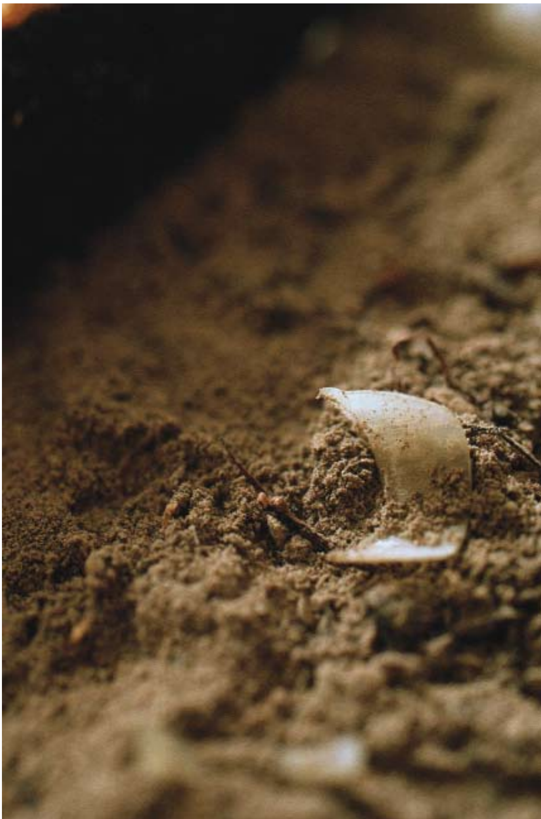
Shuruq Harb Traces of Honor , (2006) archival digital print