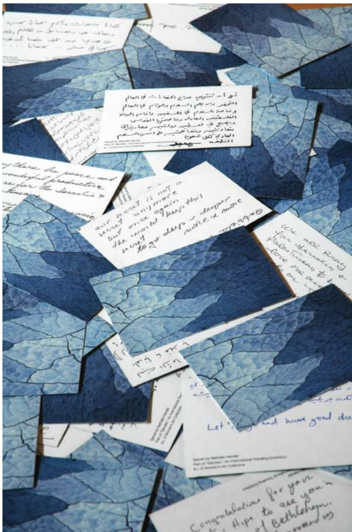
Nathalie Handal Secret , (2006) mixed media installation