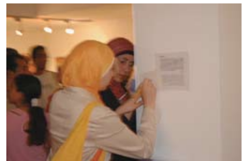
Nathalie Handal Secret , (2006) details, mixed media installation