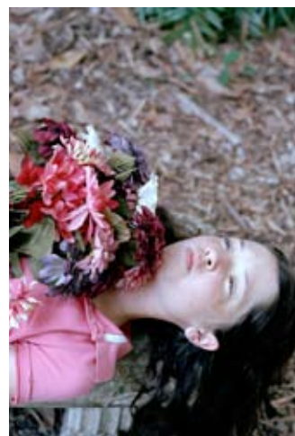
Wendy Babcox Secret Agendas , (2006) archival digital prints