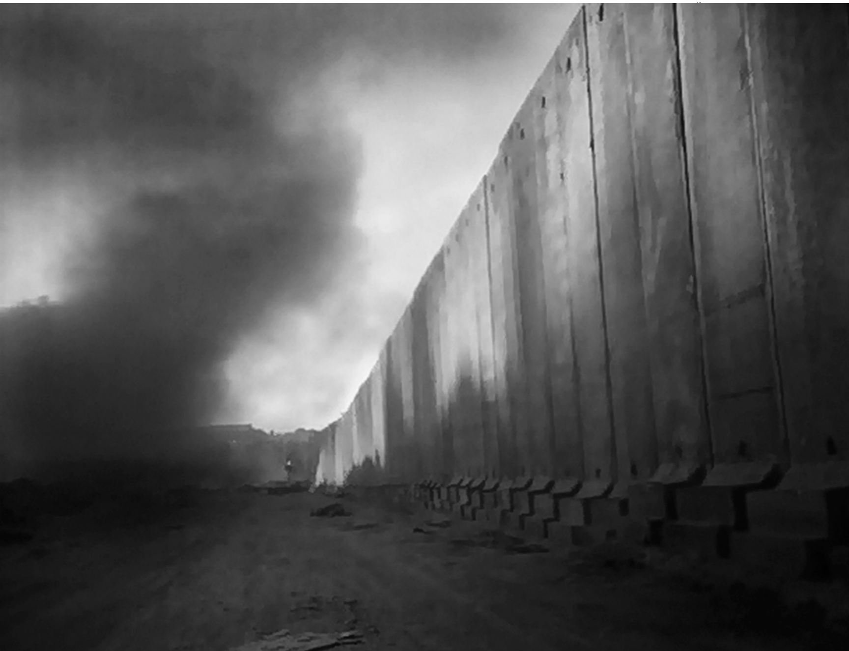
Rula Halawani The Wall , (2006) archival digital print