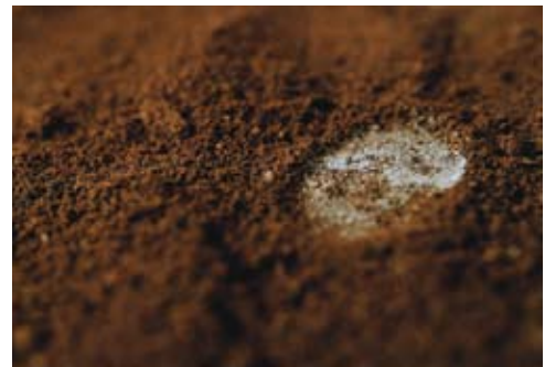
Shuruq Harb Traces of Honor , (2006) archival digital prints