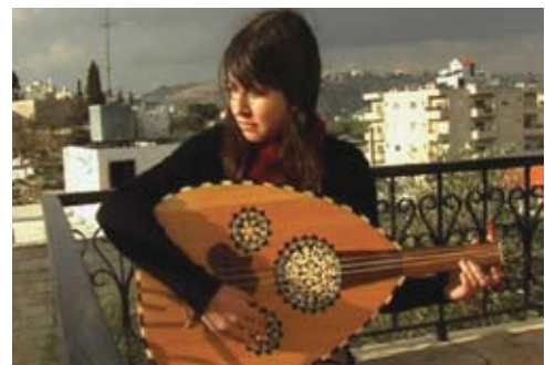
Larissa Sansour Stills from Happy Days , (2006) single-channel video